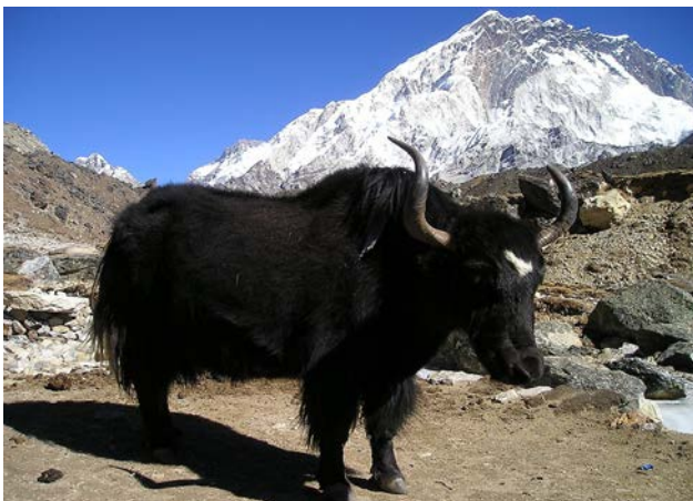
Yak – white in colour