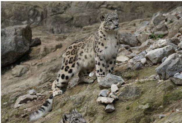
Snow leopard – no fur on pads of paws