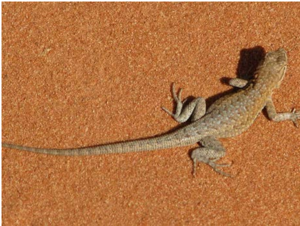
Lizard – darker colour