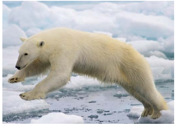
Polar bear - smaller