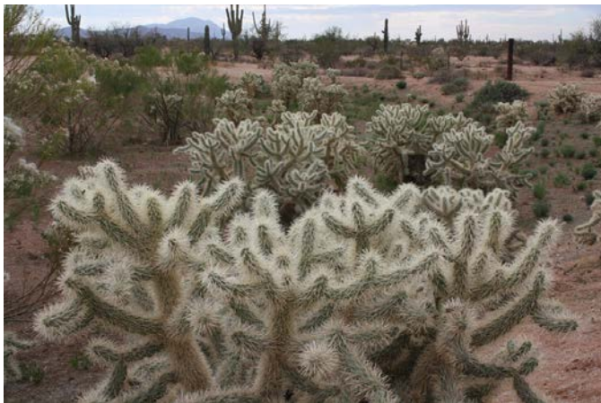
Cactus – bright red in colour