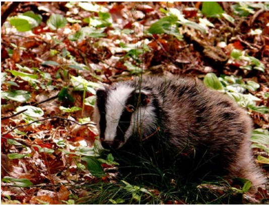
Badger – better sight