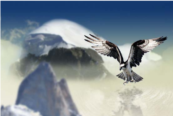
Osprey – smaller wing span