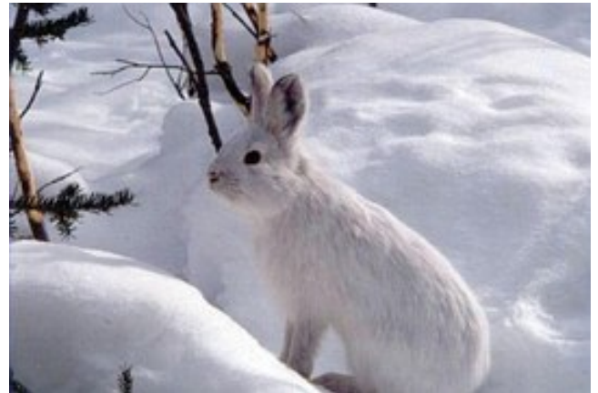
Snowshoe hare – darker fur