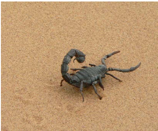
Giant scorpion – extra set of small pincers