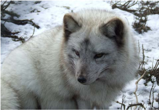
Arctic fox – I have thicker fur