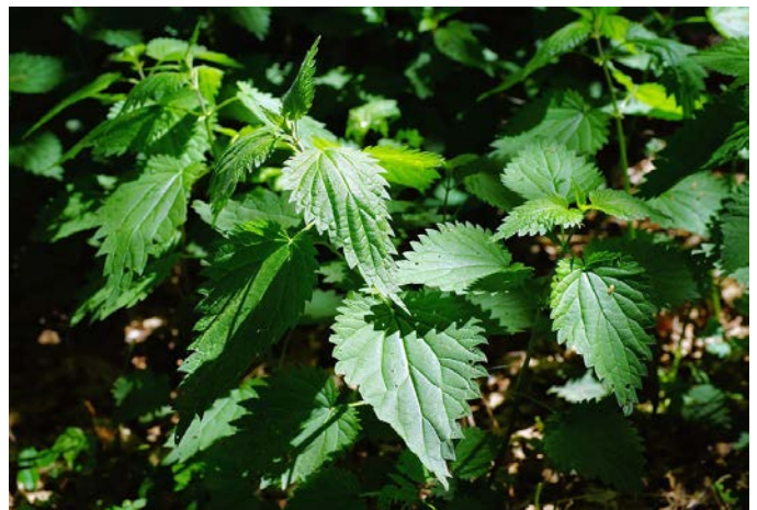
Stinging nettle that doesn't sting