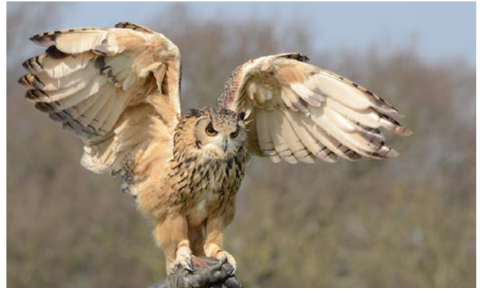
Snowy owl – larger claws