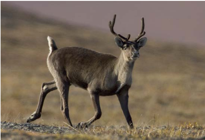
Reindeer – longer legs