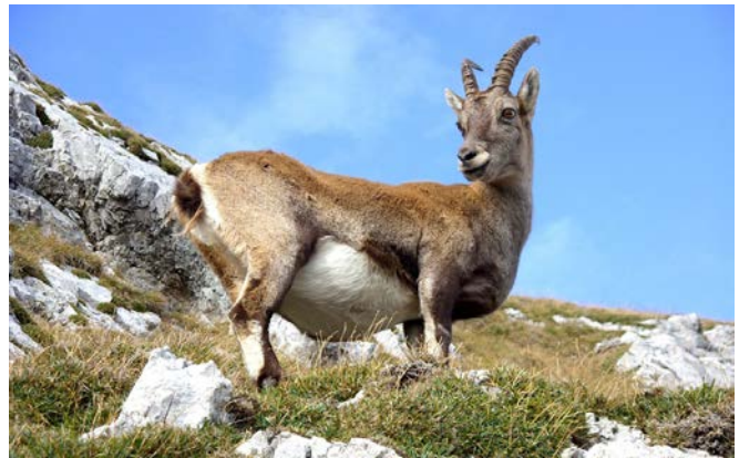
Mountain goat – better sight, poorer hearing