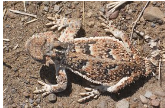
Desert toad - larger