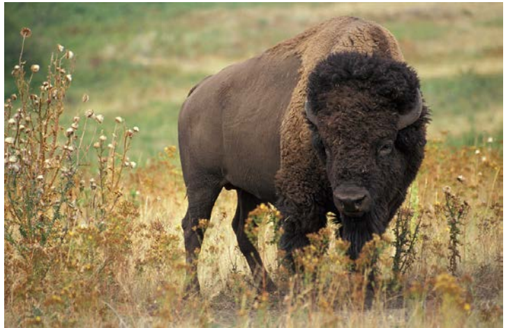
Bison smaller body but bigger horns