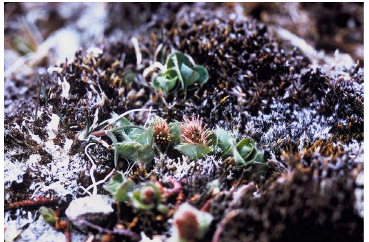
Arctic willow – leaves without fuzzy hairs