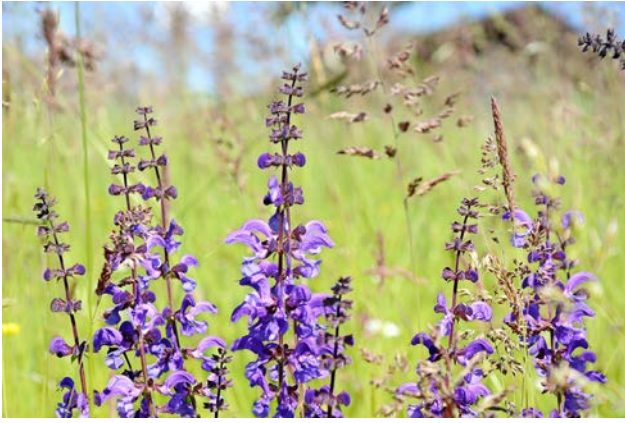
Wild sage – paler colour