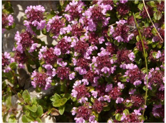
Moss campion – more but smaller flowers