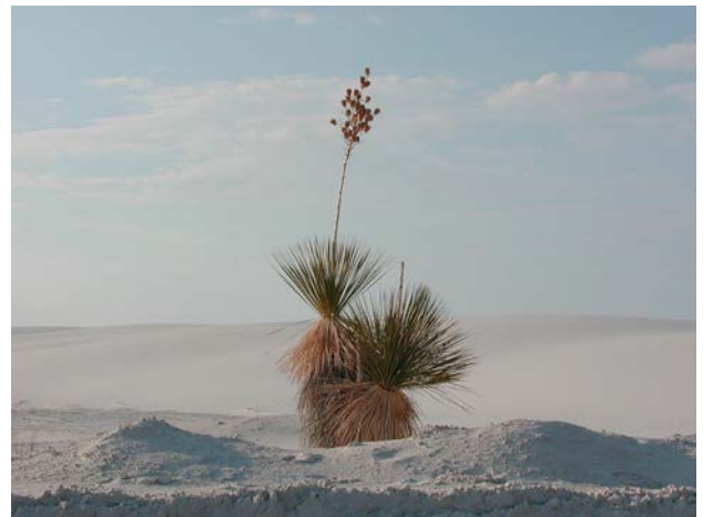
Yucca – grows taller and narrower stem