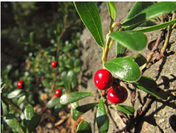
Bearberry - larger berries