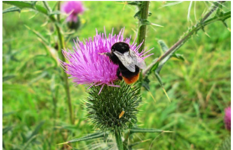
Bumble bee without stripes and thistle that is white