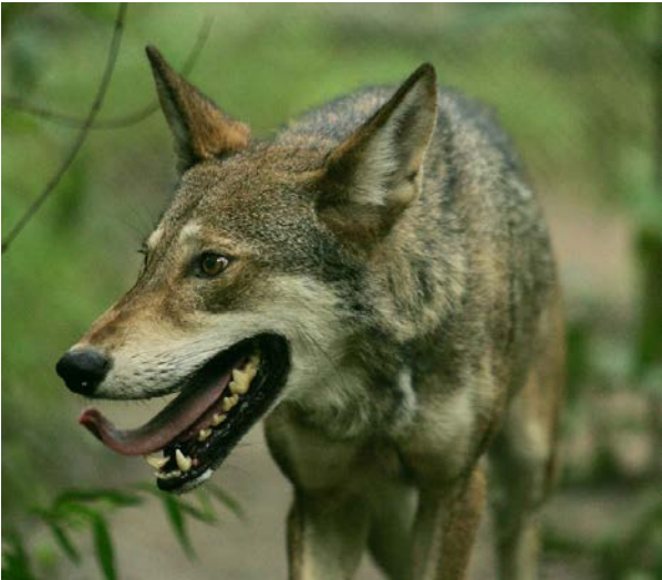
Wolf – speckled coat