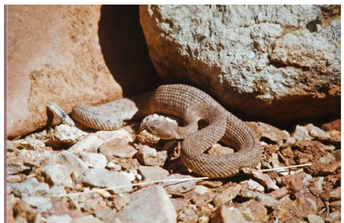
Rattlesnake - bright yellow markings