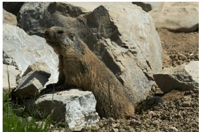
Marmot – thicker, more orange fur