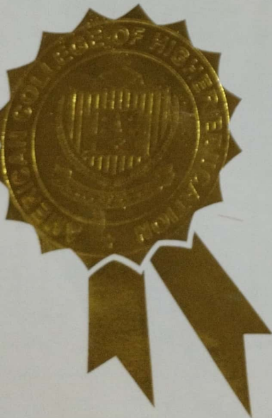
Director of Studies